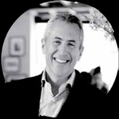
Danny Meyer CEO