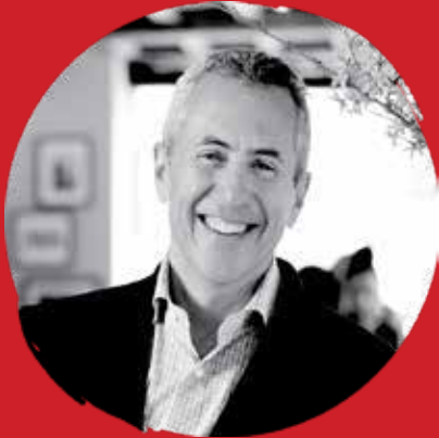
Danny Meyer CEO